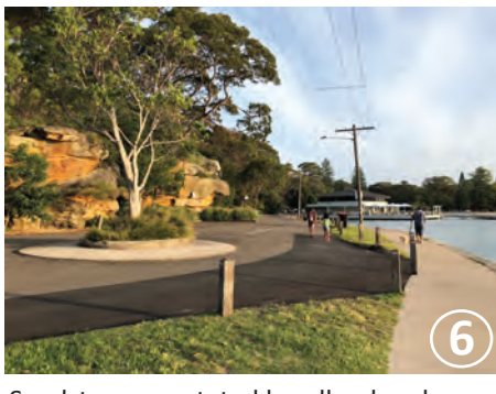
Sandstone vegetated headland and pedestrian pathway along Sandy Bay Rd