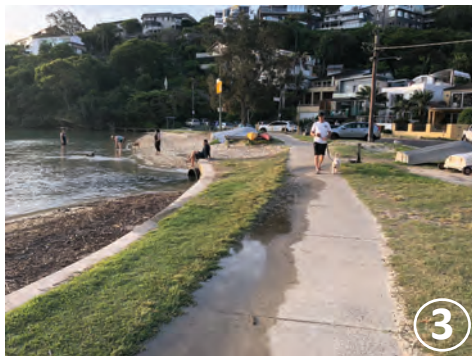
Existing sandstone walling and stormwater outlet to reserve edge