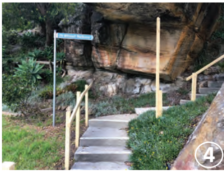
Mitchell Walkway over bushland headland