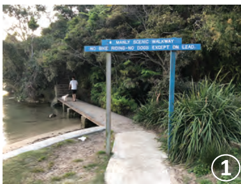
Manly Scenic Walkway to Spit Bridge