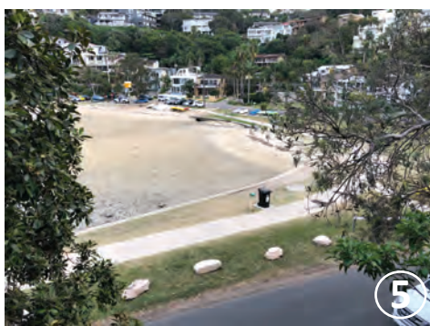
Views over Sandy Bay