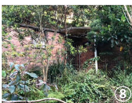
Redundant toilet block