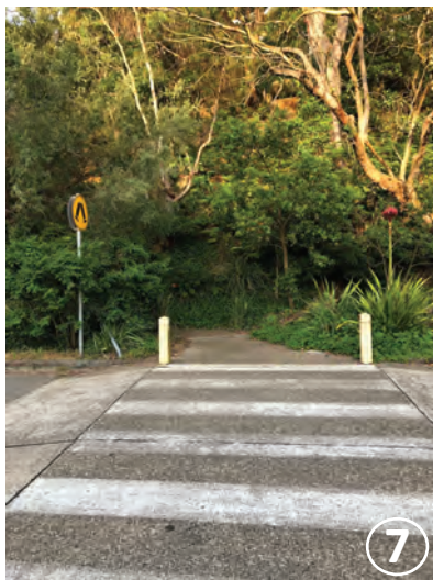
Pedestrian crossing to Mitchell Walkway