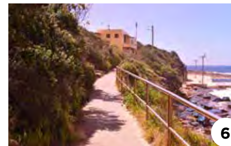
Pedestrian link to the swimming pool