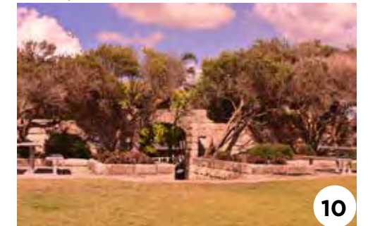
Freshwater View Reserve is secluded