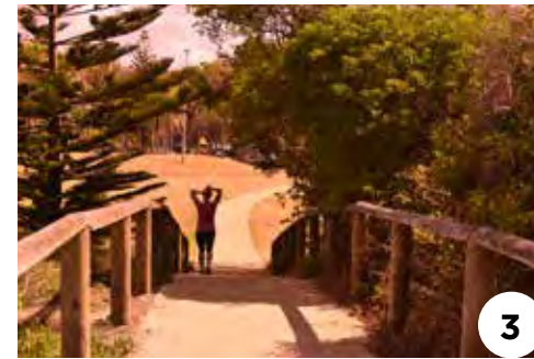
Formal pedestrian path entering central park