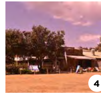
Cafe at SLSC