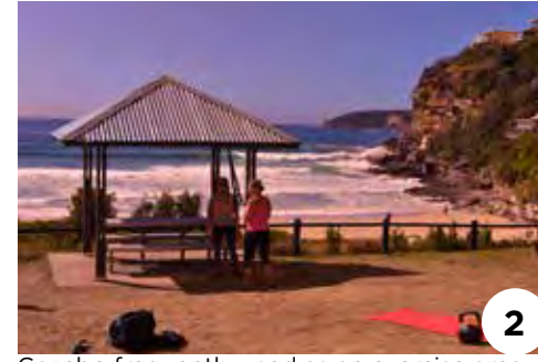
Gazebo frequently used as an exercise area