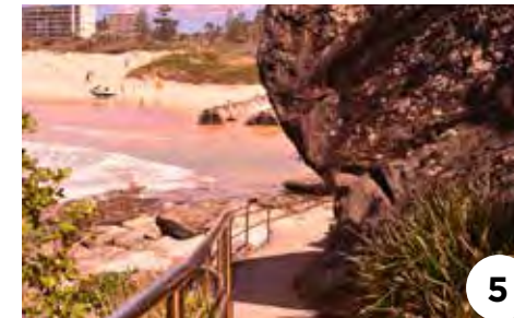
Entry to pedestrian link