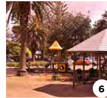
Larger children's playground