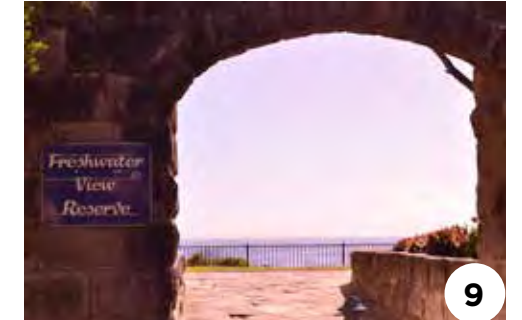
Public park with view of Freshwater