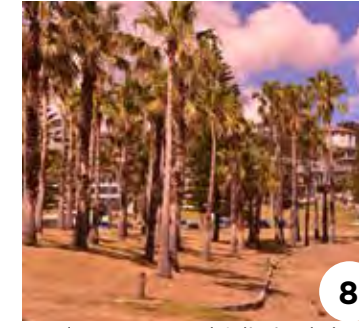
Landscape mound & limited shade