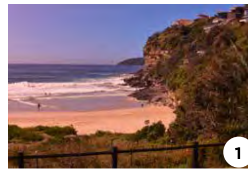
Steep slope south of the beach