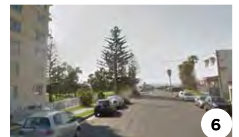
Residential apartments adjacent to park