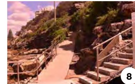
Steps to hilltop parking