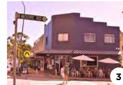
Corner cafe at Moore Road