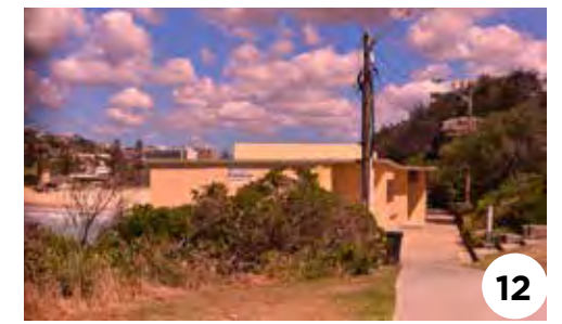
Pedestrian path to the pool and beach from hilltop carpark