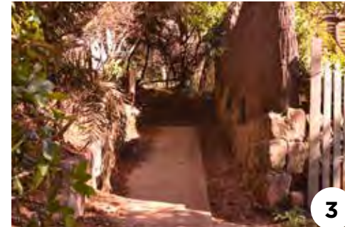
Pedestrian path adjacent to the restaurant