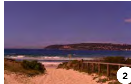
Pedestrian path to beach