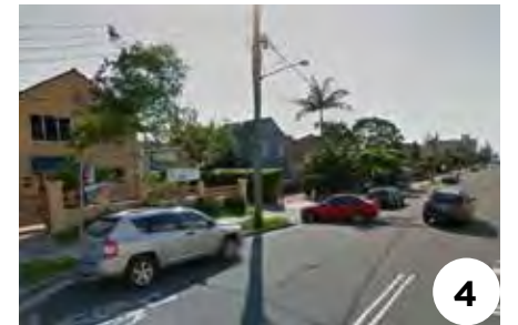
Local business at Moore Road