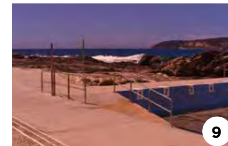
Ramp to the swimming pool