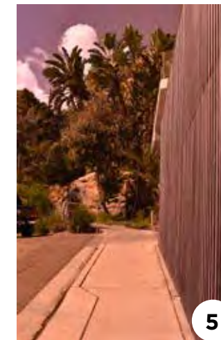
Pedestrian link on verge