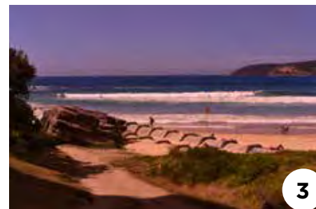
Pedestrian path ends