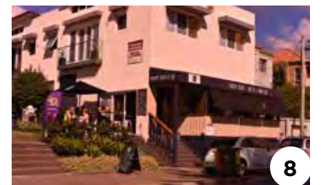
Cafe near the beach