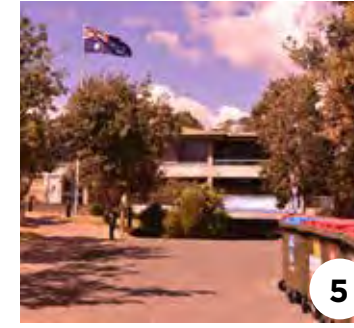
A driveway to SLSC