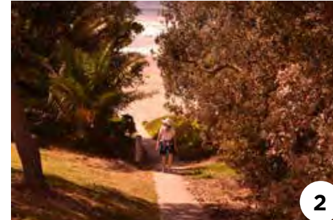
Path from beach