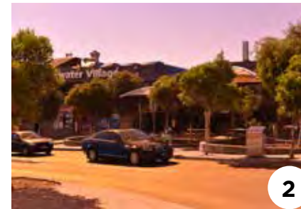
Existing Freshwater village plaza