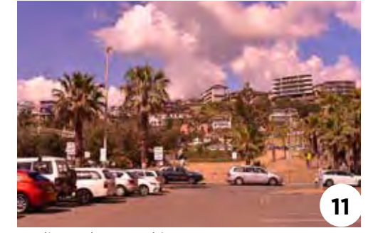
Dedicated car parking area