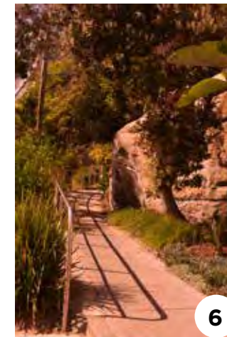
Pedestrian link continues to Bridge Road