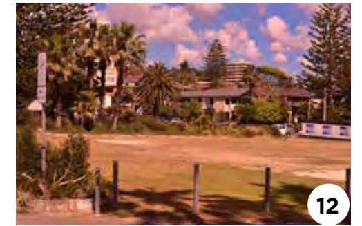
Open space for occasional parking space