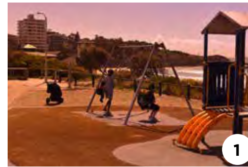
Small playground that the end of Moore Rd