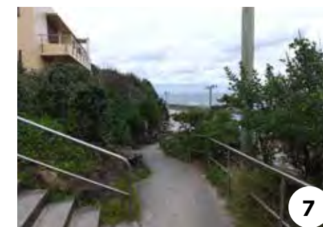
Swim club with views to Freshwater