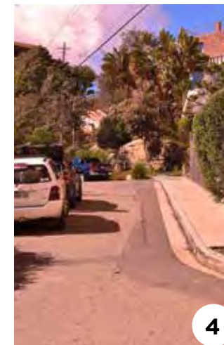
End of pedestrian path from beach