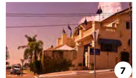
Harbord Beach Hotel