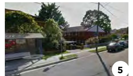
Bus stops (photo taken at Moore Road)