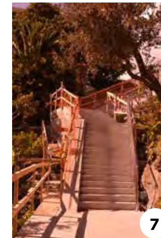
Steps to Bridge Road