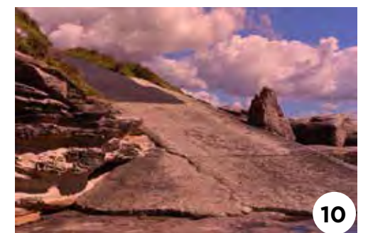
Ramp to the hilltop car parking area