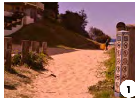
Entry to beach