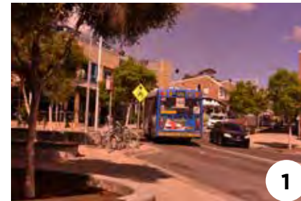
Freshwater Village - Albert and Lawrence Streets