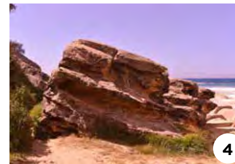
Rocky areas at the end of pedestrian path