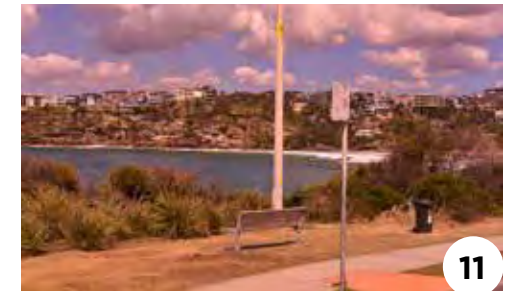
Some seating with overview to Freshwater