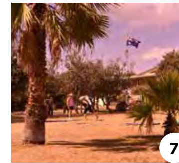
Open areas for outdoor exercise