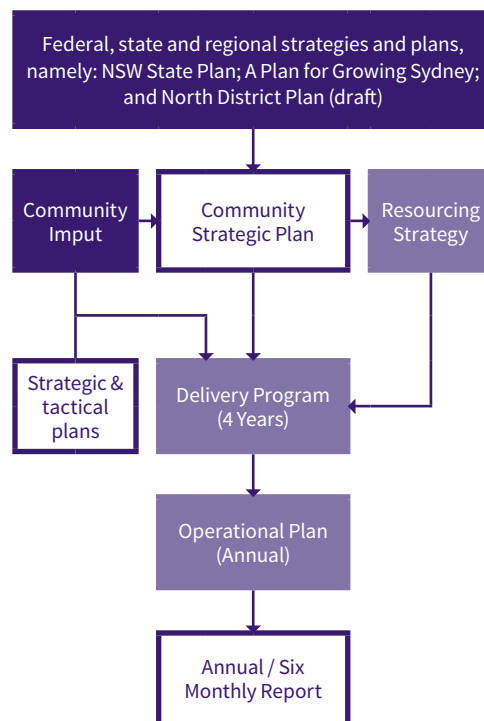
Figure 1: IP&R Framework

Other strategies and plans, and especially the four year Delivery Program and the annual Operational Plans, provide the detail and outline specific actions and projects to achieve the community's vision. Along with the CSP, these plans are statutory documents described in the NSW Local Government Act 1993 as key elements of the 'Integrated Planning and Reporting' (IP&R) Framework - see Figure 1. All IP&R documents must be prepared within the metropolitan and state planning context and with regard to the Government's NSW State Plan; A Plan for Growing Sydney; North District Plan (draft) , and any other Government plans that set strategic direction for the region.