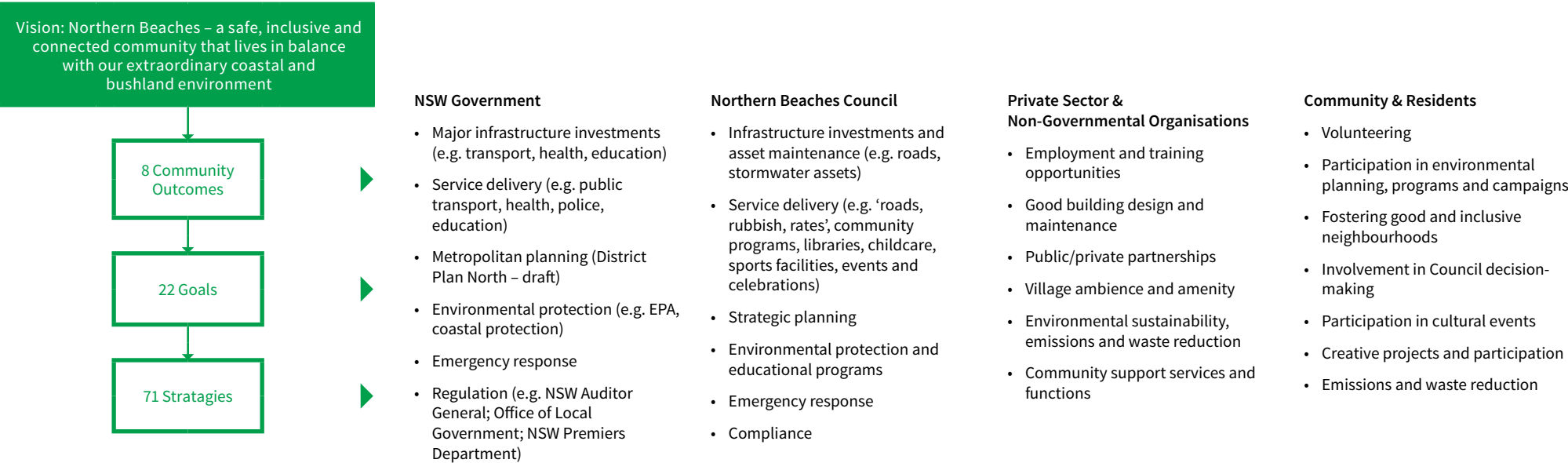
Figure 2: Partnership roles and opportunities

Figure 2 below outlines the main partners and stakeholders that Council will collaborate with on a state and federal level in implementing this CSP and making the community’s vision a reality.