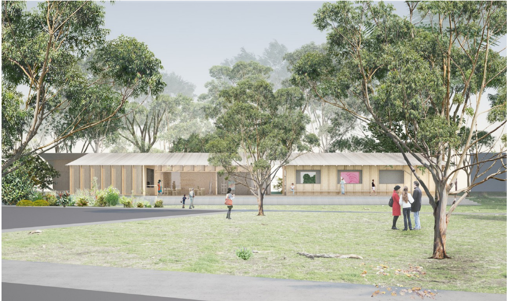
ANNEXE SITE - VIEW ACROSS DUNBAR PARK TO AN INVITING OUTDOOR DECK ENTRY SPACE.