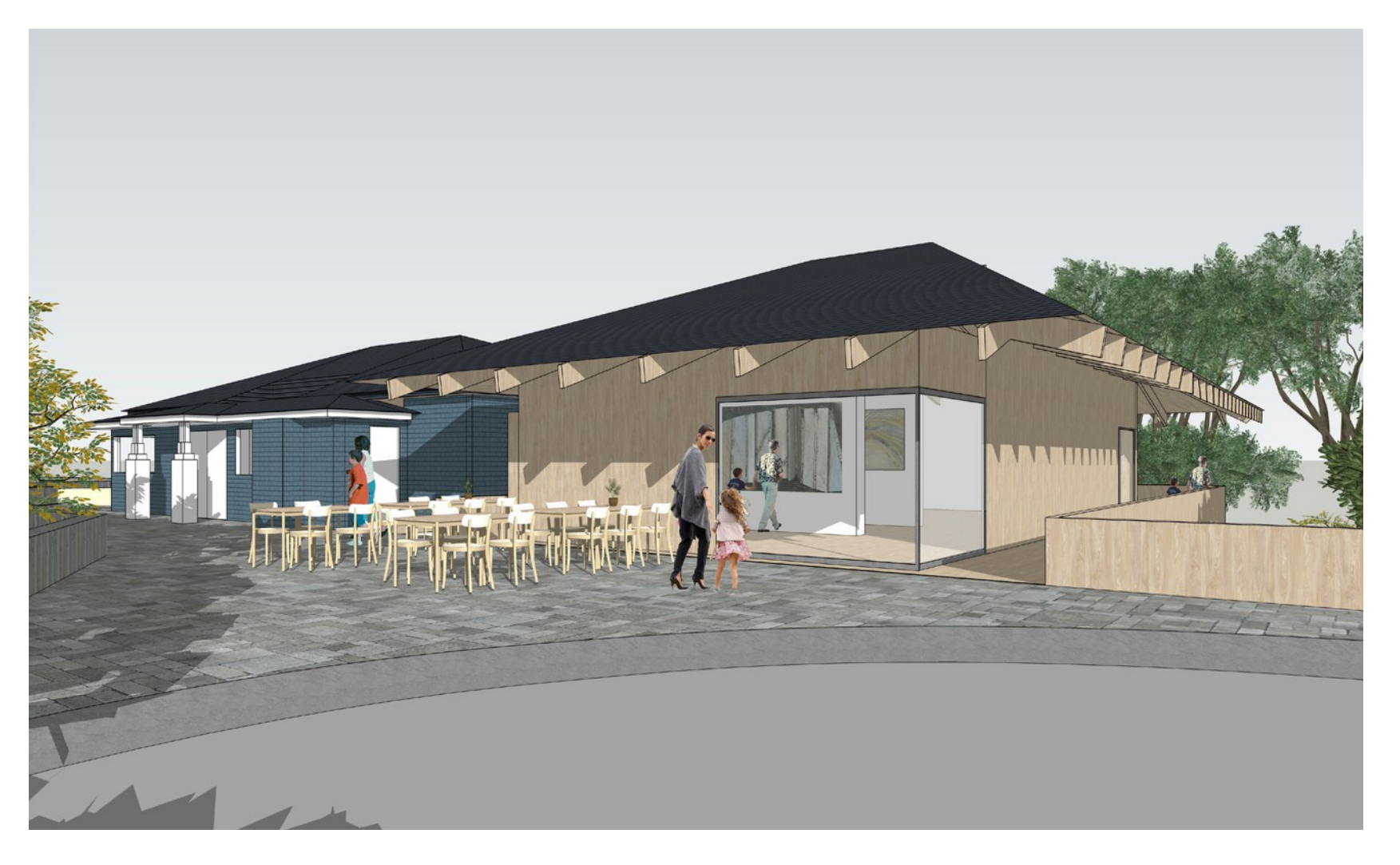
VIEW LOOKING FROM CARPARK TO OUTDOOR CAFE AND EXHIBITION