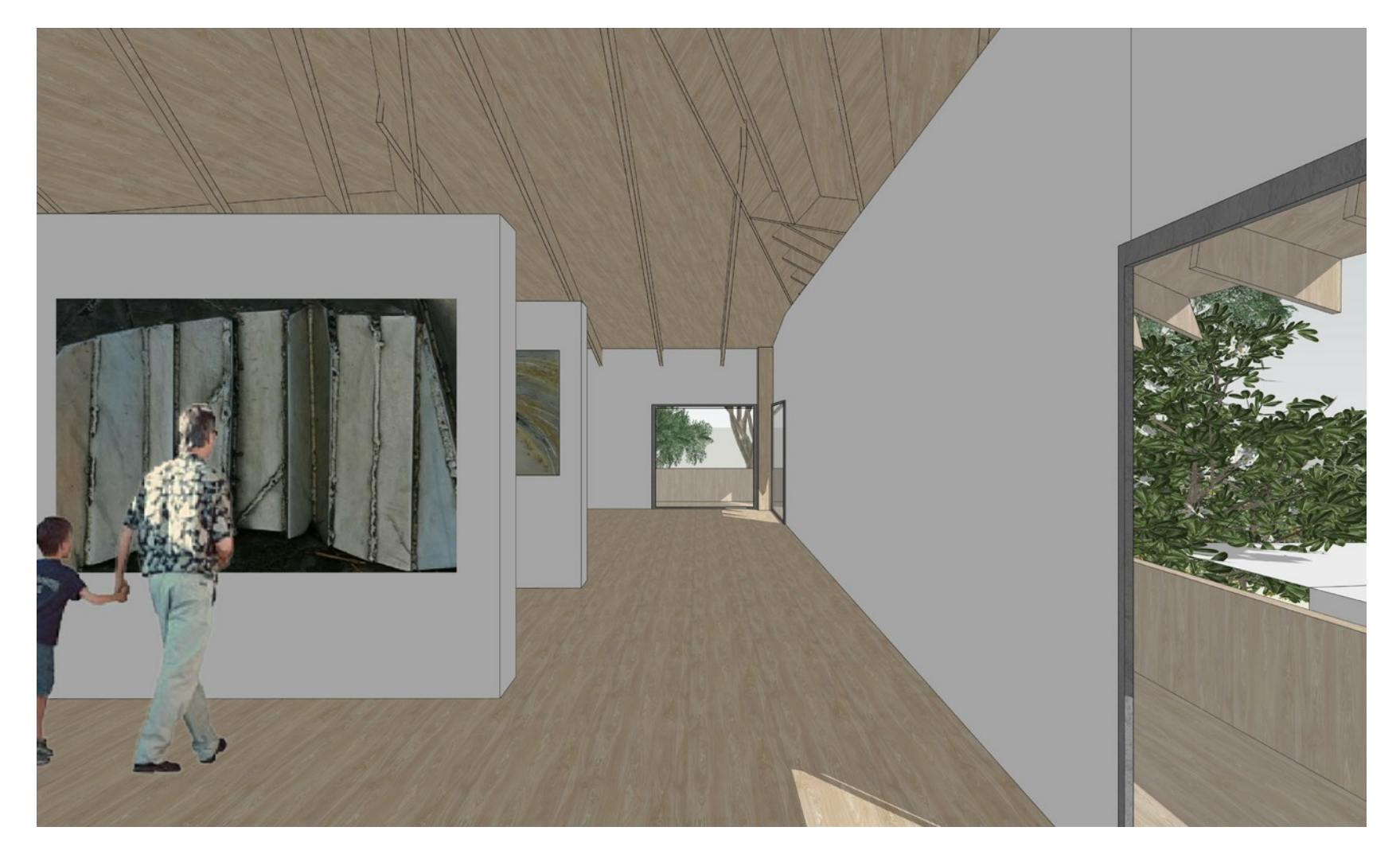
INTERIOR VIEW LOOKING THROUGH EXHIBITION SPACE WITH HIGH VOLUMETRIC SPACE