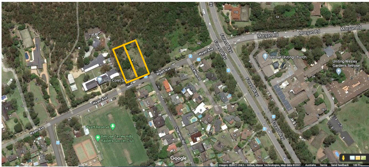
Figure 2 Location of the subject lots

The land comprising Wyatt Avenue Bike Park is owned by Northern Beaches Council as shown in Figure 3.