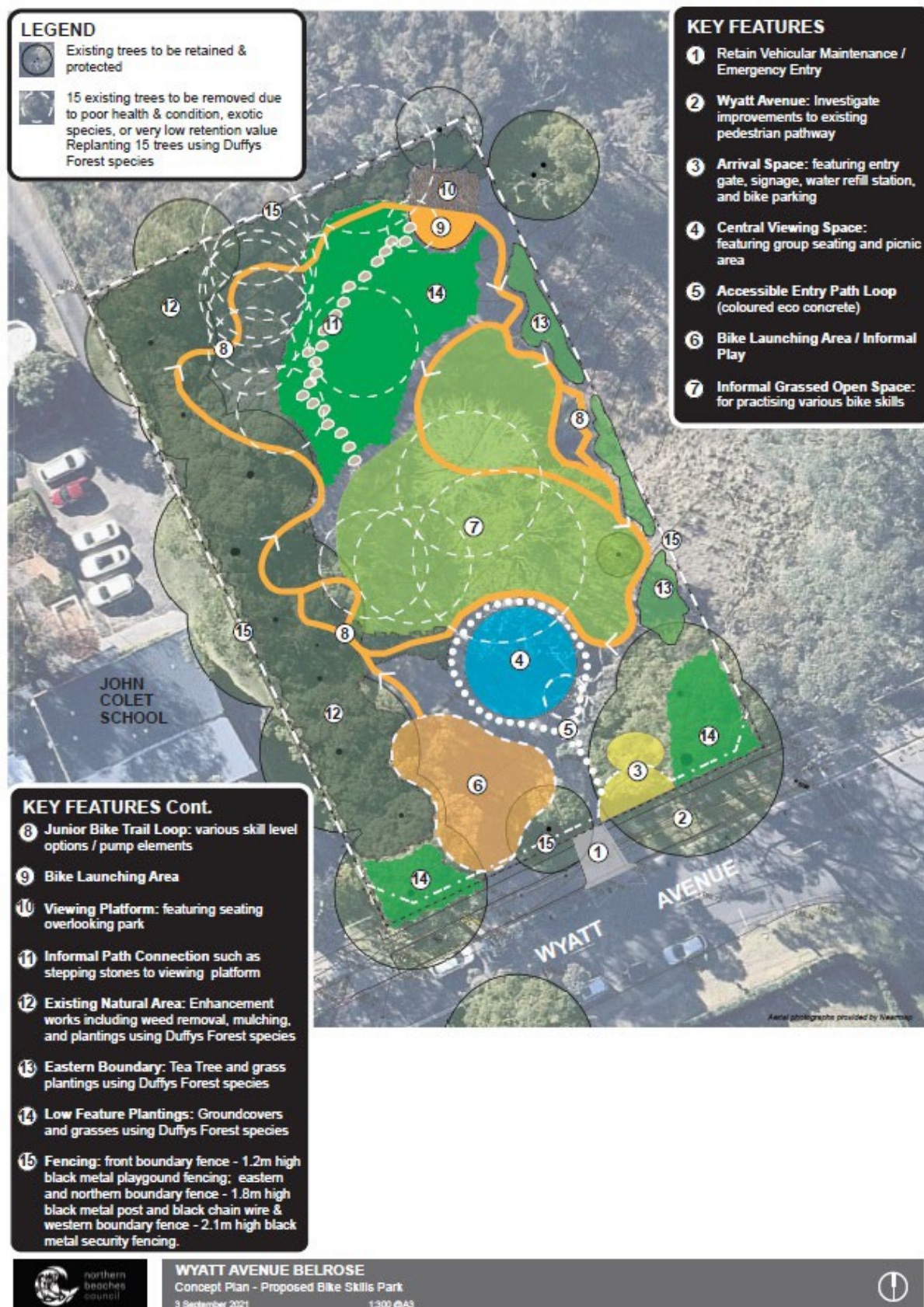
Figure 5 Wyatt Avenue, Belrose: Concept Plan – Proposed Bike Skills Park

Council believes the Park category best fits the proposed development and use of Lot 102 DP1244381 and Lot 2620 DP752038 as a junior bike skills park and for public recreation as shown on the concept plan, because the proposed uses are consistent with the guidelines and core objectives for categorisation of community land as Park (refer to Table 1).