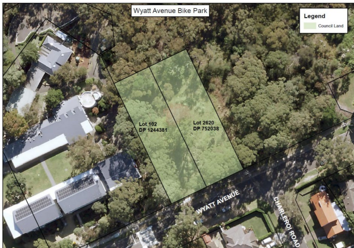
Figure 3 Ownership of Wyatt Avenue Bike Park

The land comprising Wyatt Avenue Bike Park is owned by Northern Beaches Council as shown in Figure 3.