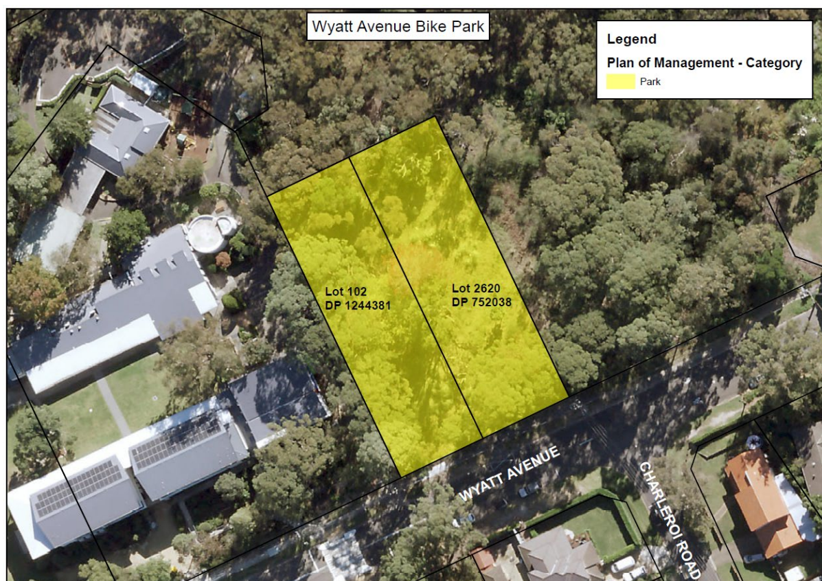
Figure 6 Proposed categorisation of Wyatt Avenue Bike Park

The Park category as it is proposed to apply to the Wyatt Avenue Bike Park is shown in Figure 6.