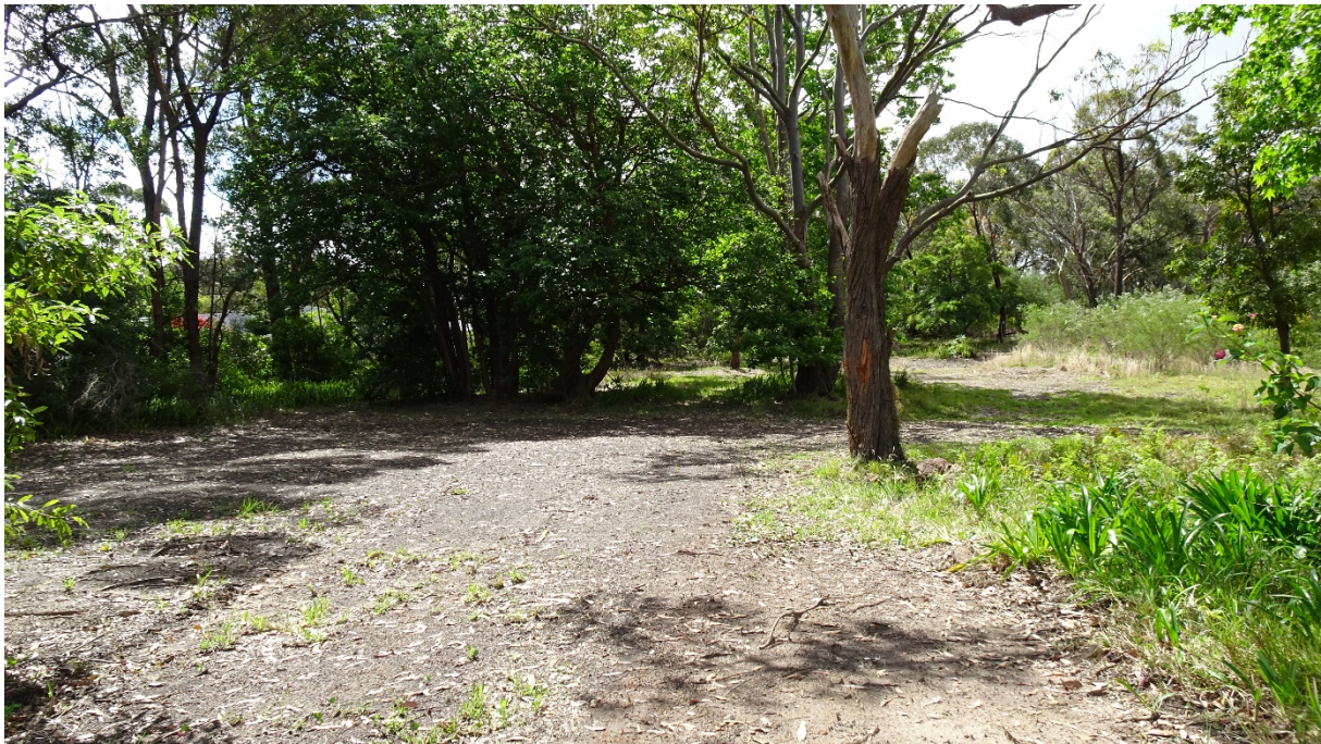
Figure 4 Site photos

Photographs of the proposed bike park site are shown in Figure 4.