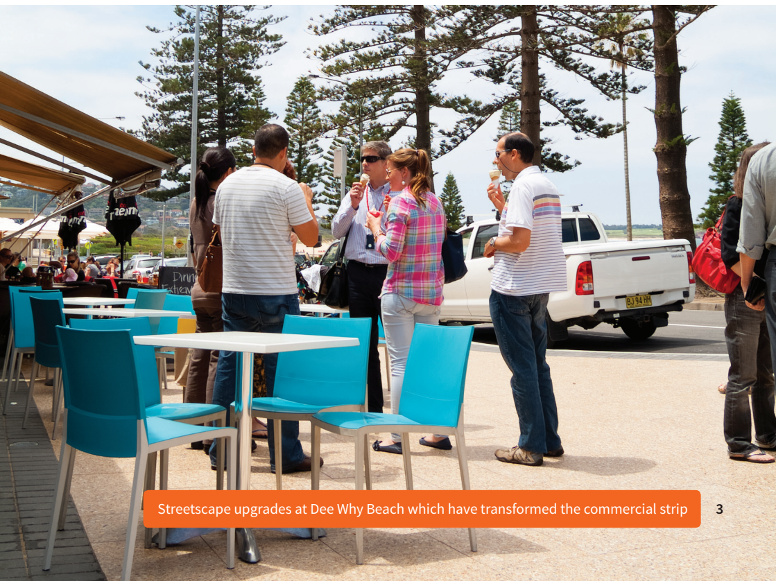
Streetscape upgrades at Dee Why Beach which have transformed the commercial strip

Construction is estimated to take in the order of six months. There will be disruptions along the way, but the benefits will be considerable once the works are complete. You only need to look at the recently upgraded "The Strand" at Dee Why Beach to see how street upgrades have transformed and reactivated this commercial strip.