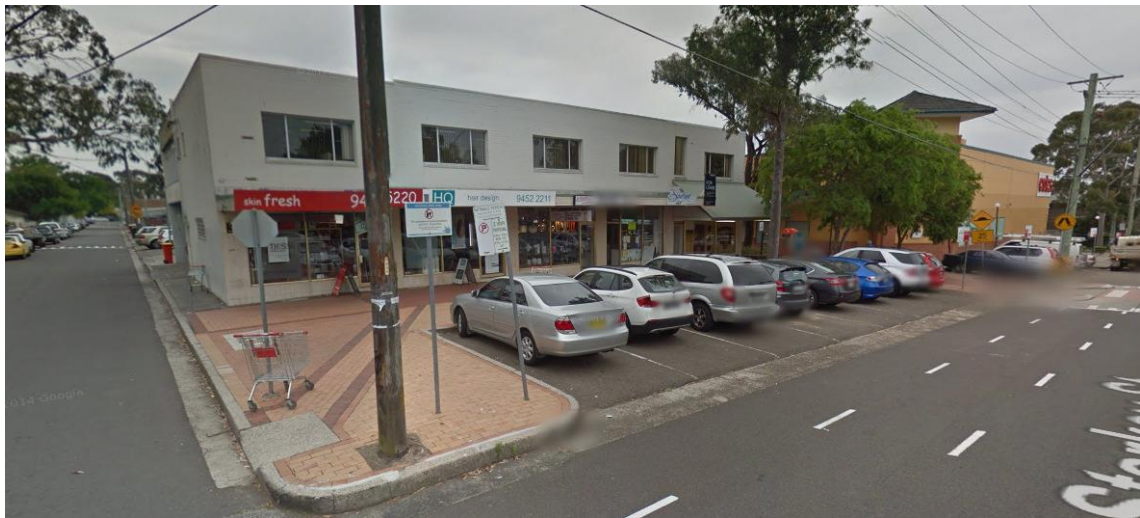
Photo 6: Allotment 5 viewed from the corner of Starkey Street and Violet Lane with Forestville local centre shops (Source: Google maps, 2013).