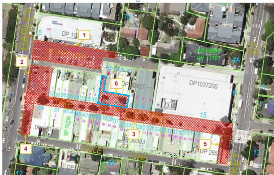
Photo 1 Aerial photograph

Showing subject site at Darley & Starkey Streets, Forestville (crosshatched) with separate allotments identified. Land subject to reclassification is outlined blue. (Source: Warringah Council Planning Proposal)