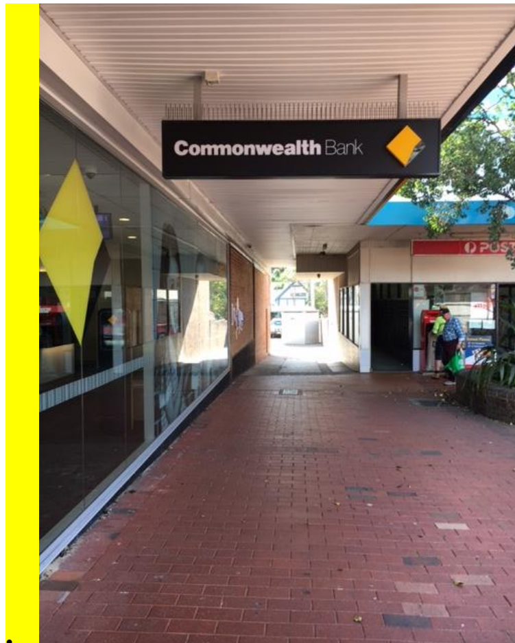
Photo 3: Allotment 6 from the north western corner toward car parking area (Allotment 1).