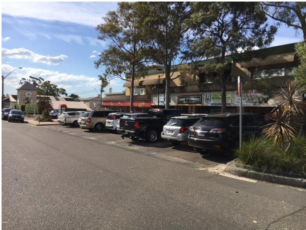
Photo 5: Allotment 4 (carparking area) viewed from Darley Street, Forestville.