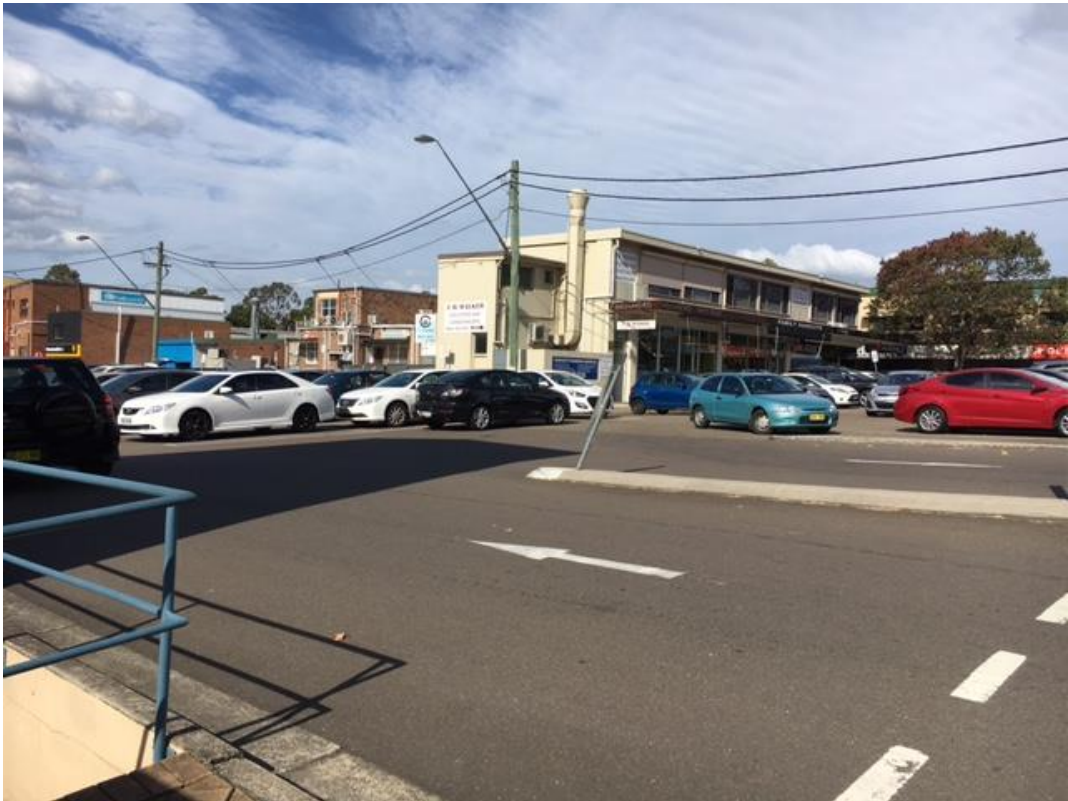
Photo 4 : Allotment 1 and 2 (carparking areas) (Source: J Sneyd 23 May 2016).