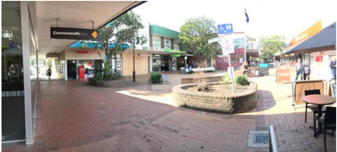
Photo 2: Allotment 6 "The Centre" from the north western corner (looking east) (Source: J Sneyd 23 May 2016).

Reclassification of Community Land to Operational Land Forestville Local Centre Parking and Accessways