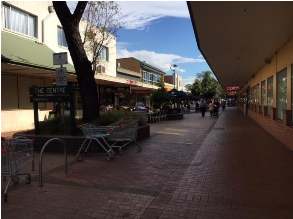
Photo 7: Allotment 3 “The Centre” viewed from eastern end Starkey Street, Forestville (looking west) (Source: J Sneyd 23 May 2016).

Photos 4 – 7 above and on the previous page indicate the remainder of the allotments of land within the Planning Proposal.