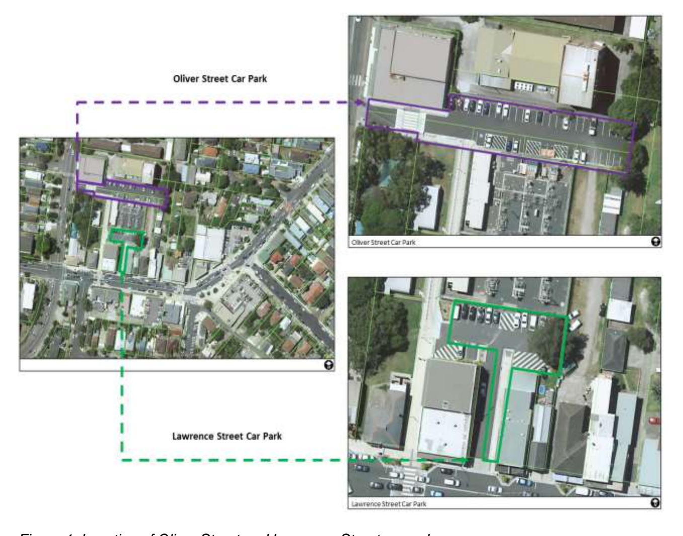
Figure 1: Location of Oliver Street and Lawrence Street carparks