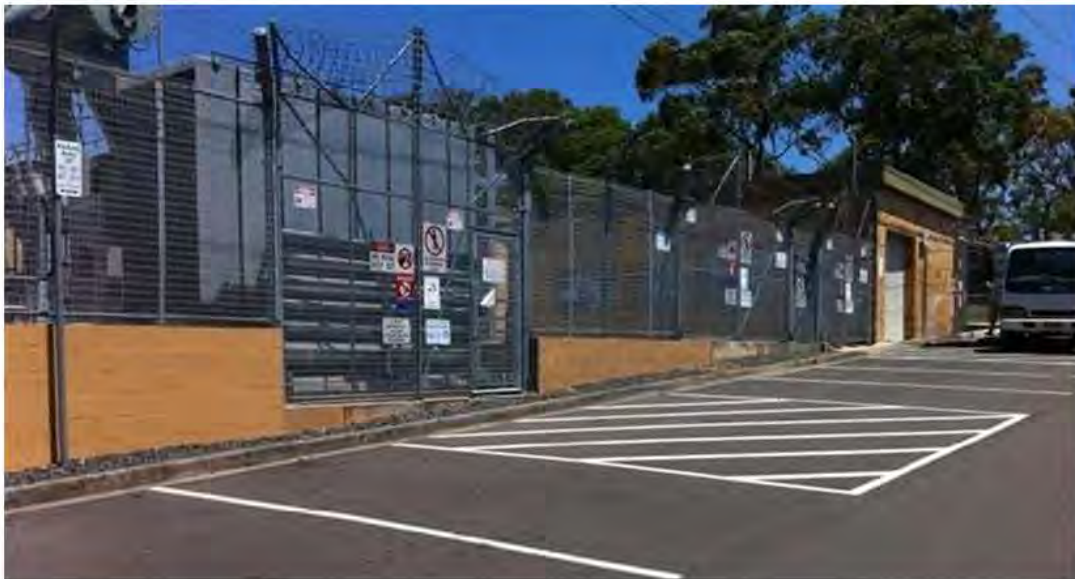
Figure 9 - Ausgrid Substation