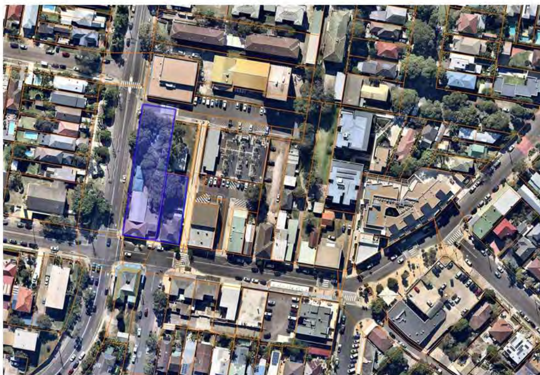
Figure 3 – Heritage items indicated in purple