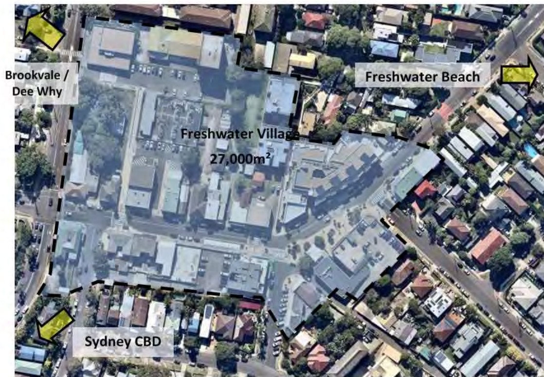
Figure 1 – Freshwater Village Locality

shop top housing interspersed with more recent larger scale two and three storey retail, commercial and apartment mixed use developments.