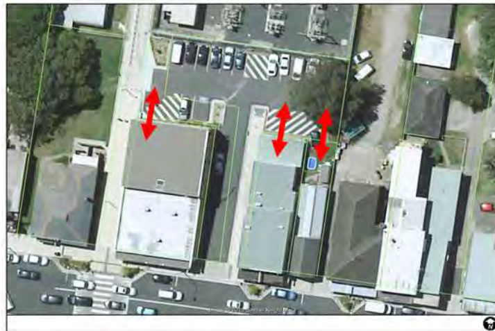
Figure 7 - Informal Access onto Lawrence Street Car Park

A number of private land holdings adjoining the land currently gain private access to and from the land. The informal access is a direct result of location, directly backing onto Community Land and the established built form of the Freshwater Village, prior the Local Government Act 1993 (Figure 7 and Figure 8).