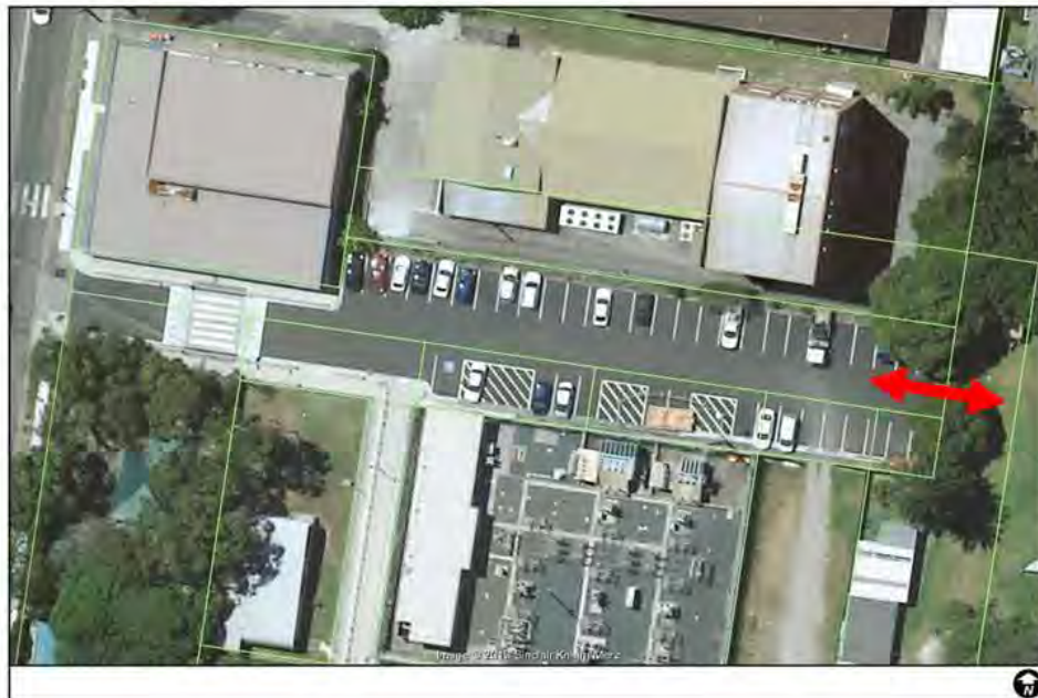
Figure 6 - Agreement with 15 Lawrence Street and Council

On 2 February 1970 Council resolved to acquire a private parcel of land in order to extend and improve the Oliver Street car park. Acquisition was subject to conditions including that vehicular access be maintained between the carpark and an adjoining privately owned allotment, 15 Lawrence Street, at all times (Figure 6). The parcel was subsequently acquired in accordance with the approved conditions.