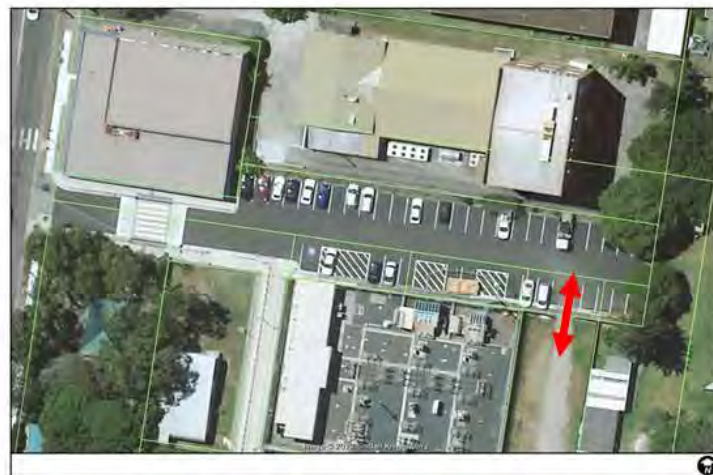
Figure 8 - Informal Access onto Oliver Street Car Park

The only way access can formally be permitted to these properties is through the reclassification of both the Oliver Street and Lawrence Street car parks.