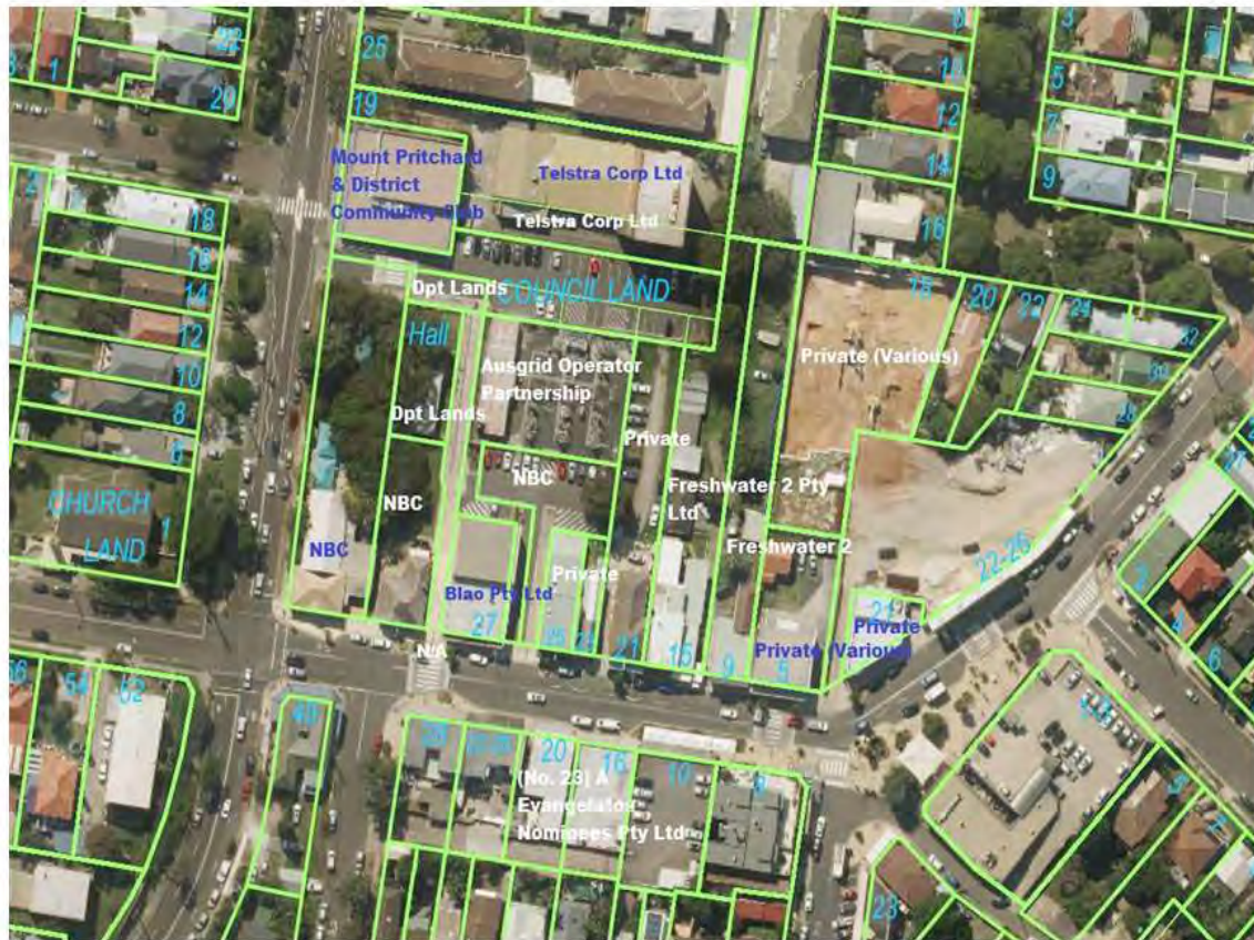
Figure 10 - Land Ownership - ownership defined by green cadastre