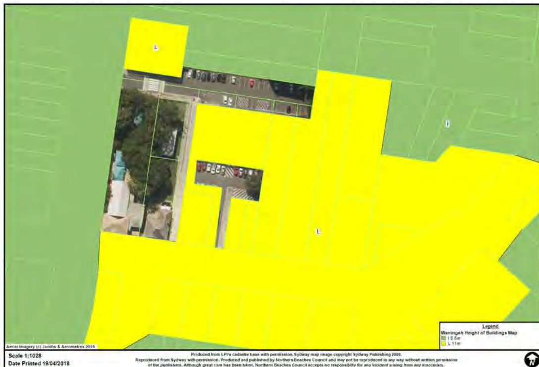
Figure 4 – Maximum Building Height

The residential areas surrounding the village have a maximum building height of 8.5 metres (see Figure 4).