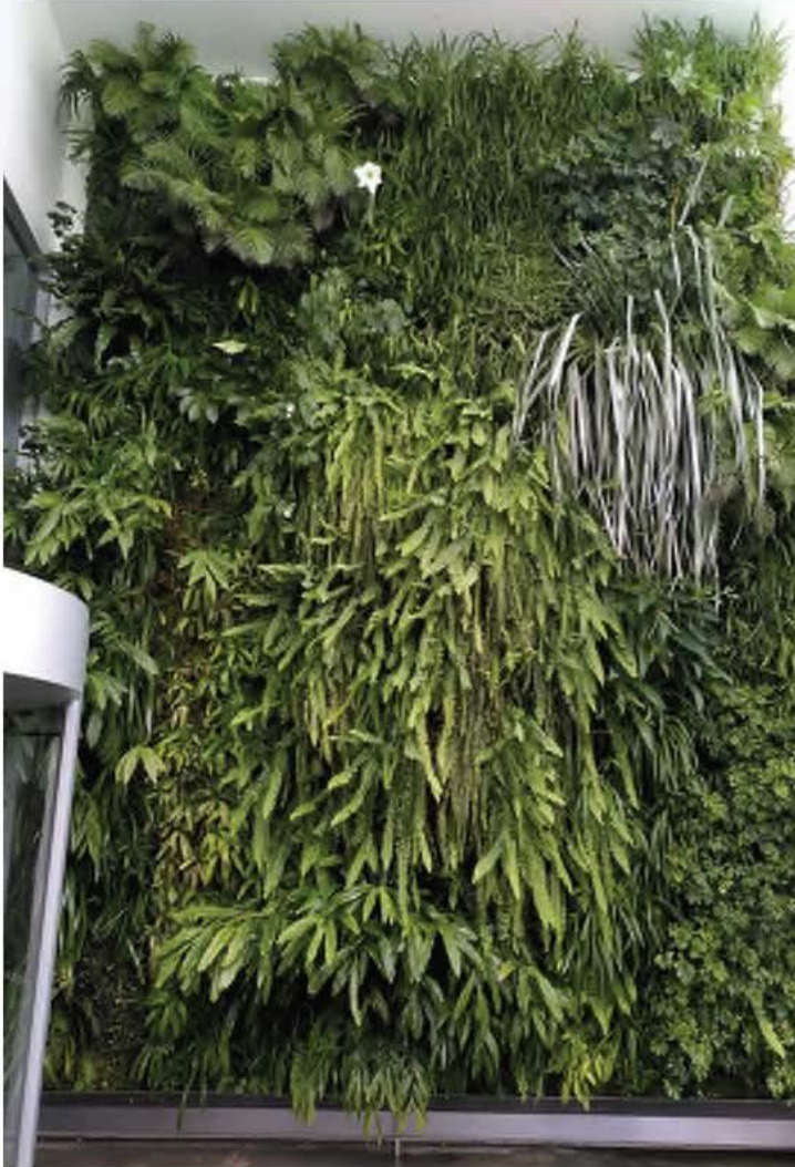
Sussan – Melbourne – 15 year old