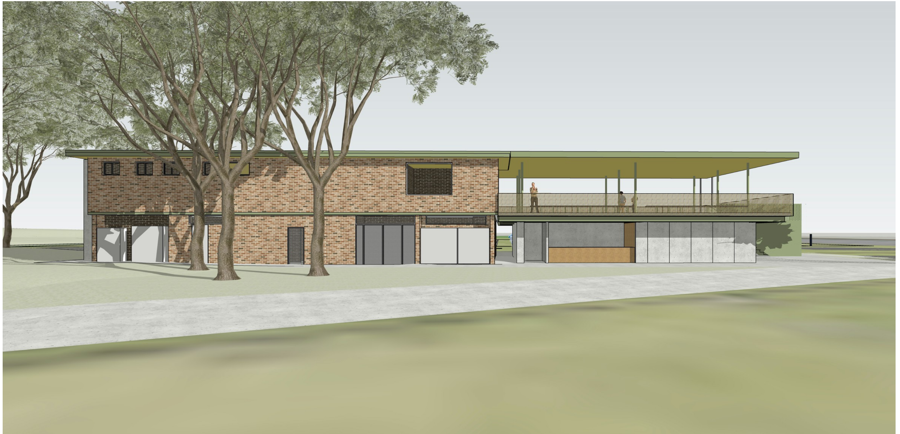
EAST ELEVATION - DOOR OPEN