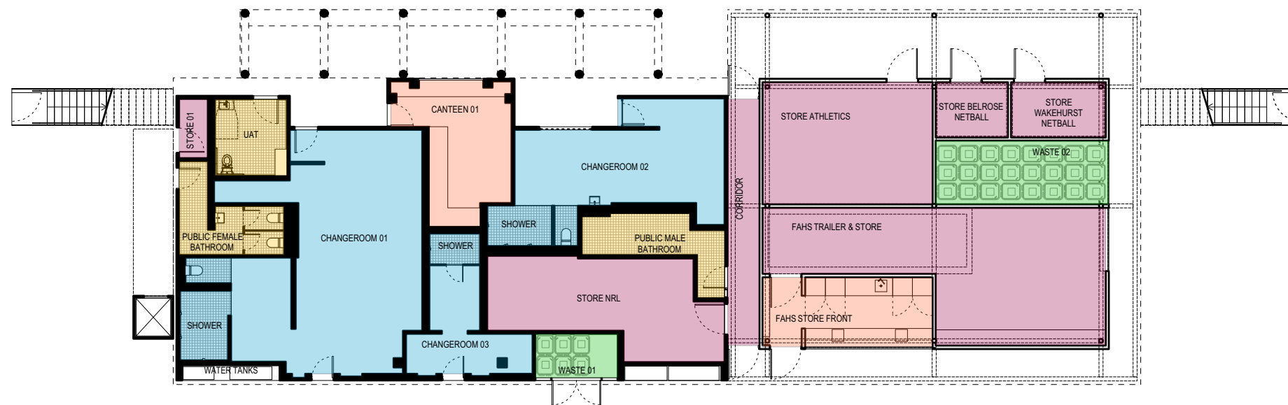
1 PROPOSED GROUND PLAN 1:200