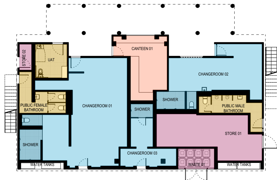
1 EXISTING GROUND PLAN 1:200