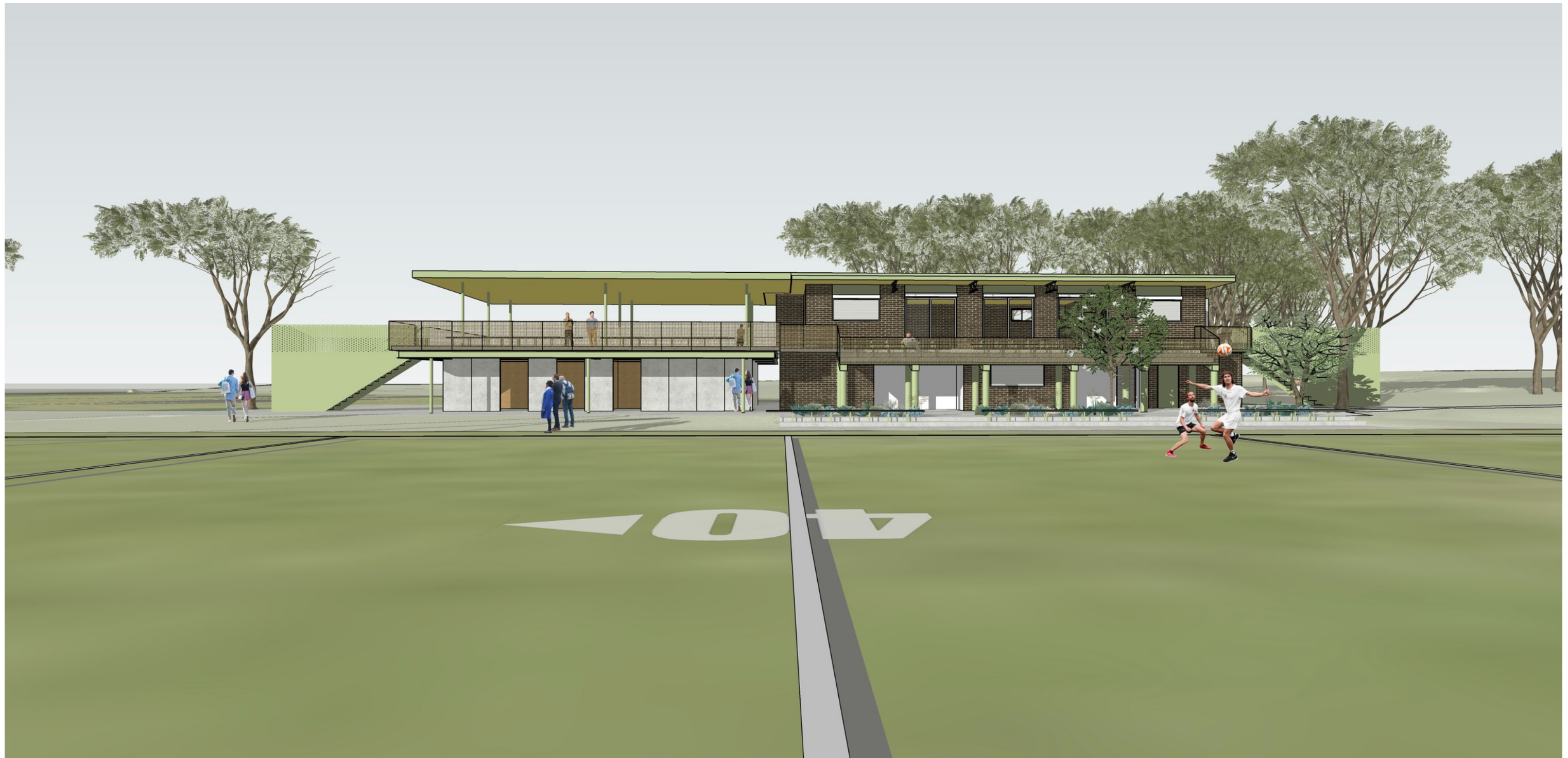
WEST ELEVATION - DOORS OPEN