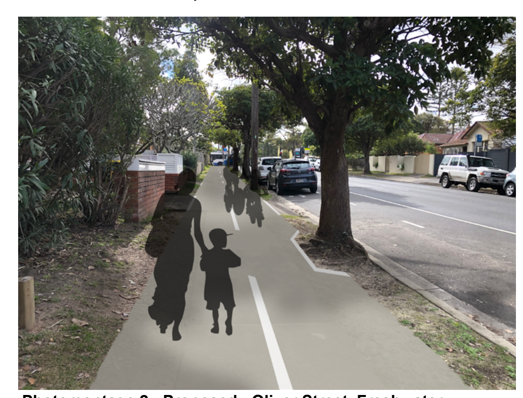
Photomontage 2 - Proposed - Oliver Street, Freshwater Refer to location on Concept Plan