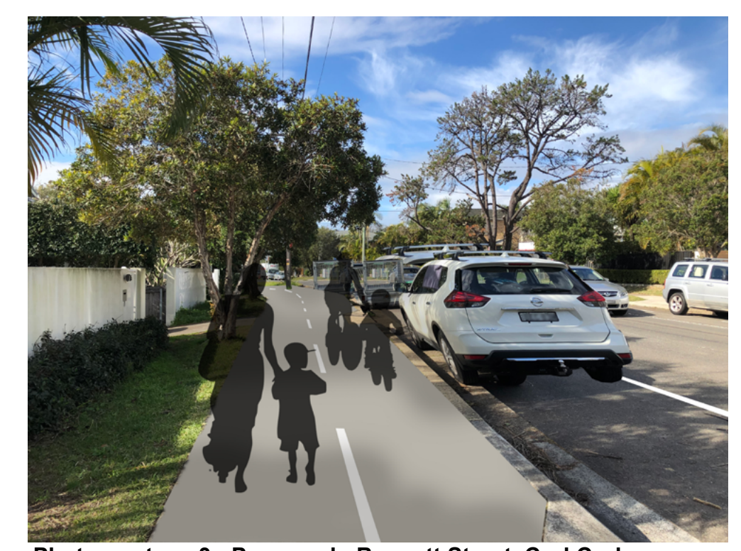
Photomontage 3 - Proposed - Bennett Street, Curl Curl Refer to location on Concept Plan

Note: Concept photomontages are intended to give a visual impression of how the proposal may look within the existing streetscape.