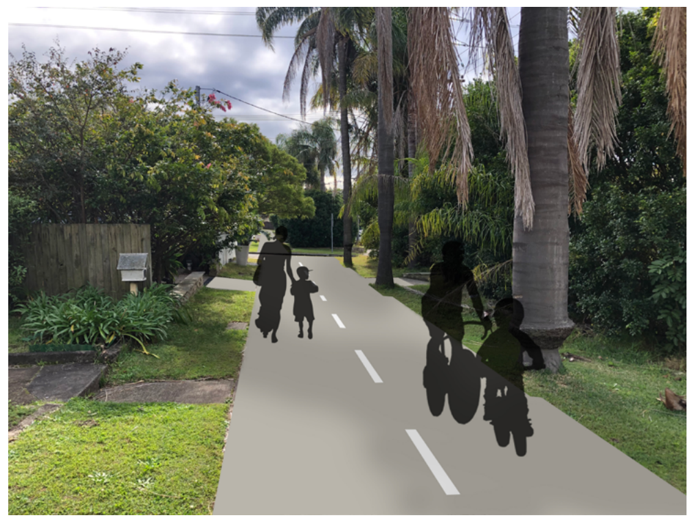
Photomontage 1 - Proposed - Oliver Street, Freshwater Refer to location on Concept Plan