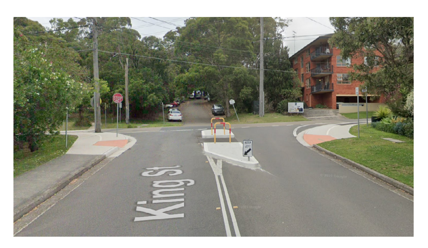
Safer Crossing Treatment Example

Raised Pedestrian and Cycleway Priority Crossing (Kalinya Street, Newport)