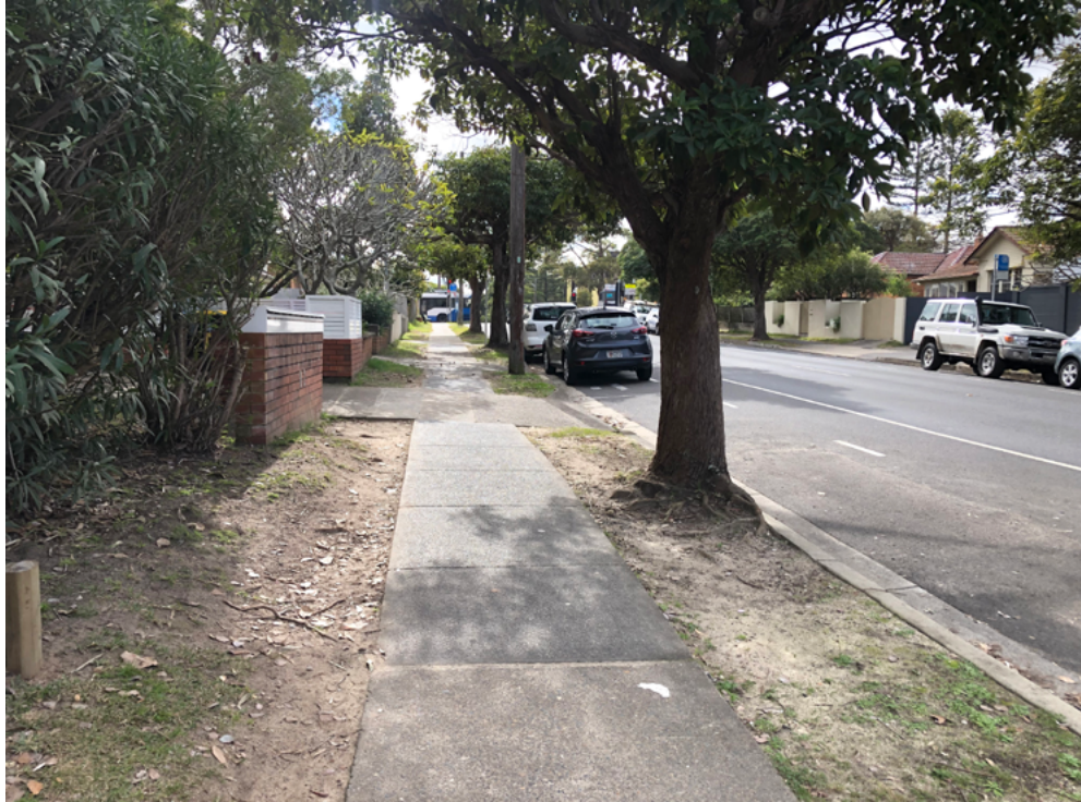
Existing - Oliver Street, Freshwater