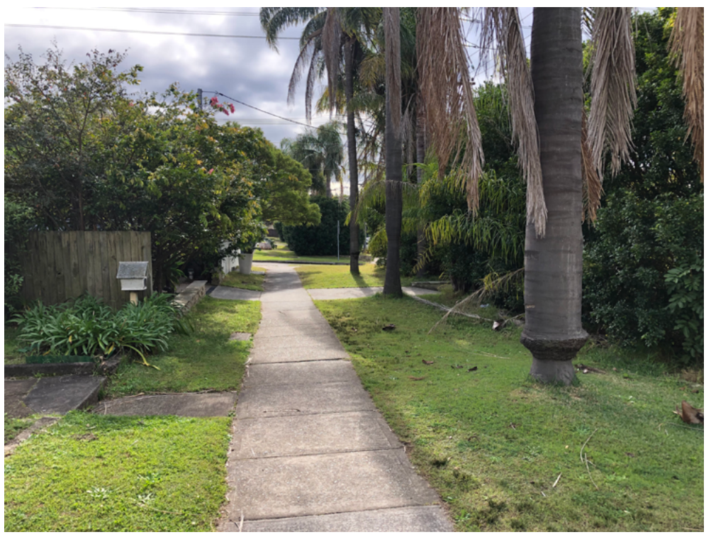
Existing - Oliver Street, Freshwater