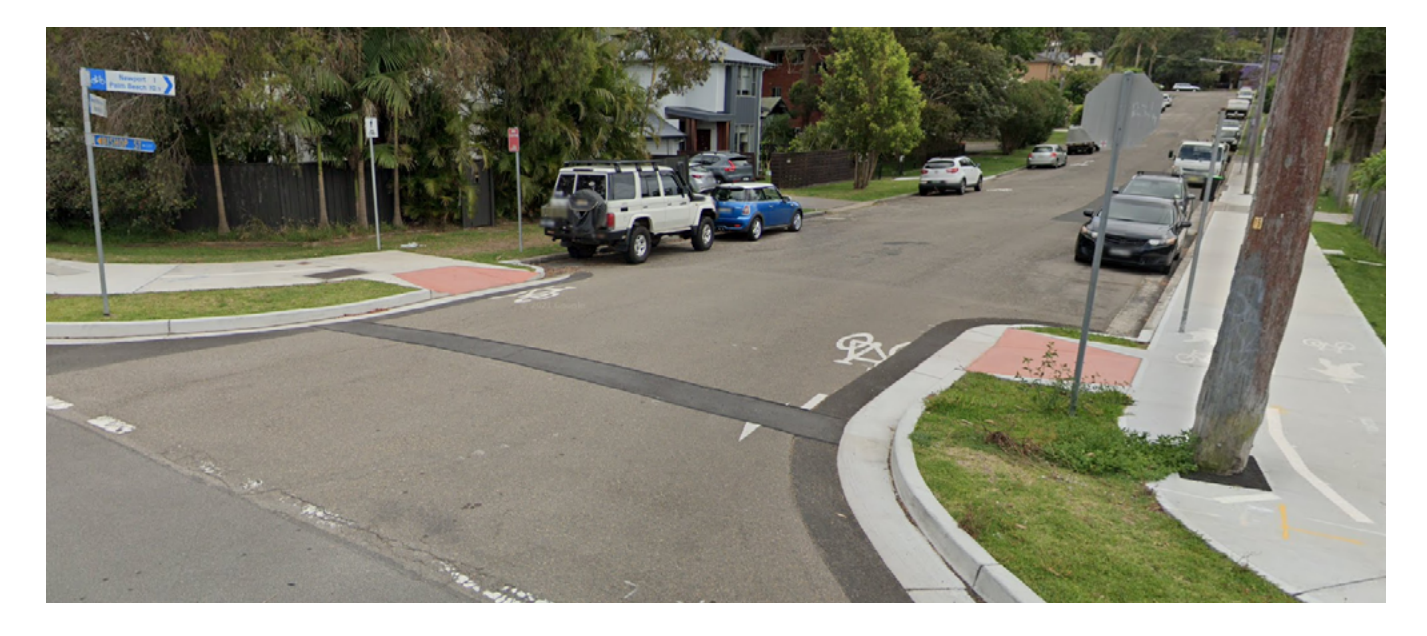
Safer Crossing Treatment Example

Bent out crossing with refuge (King Street, Newport)