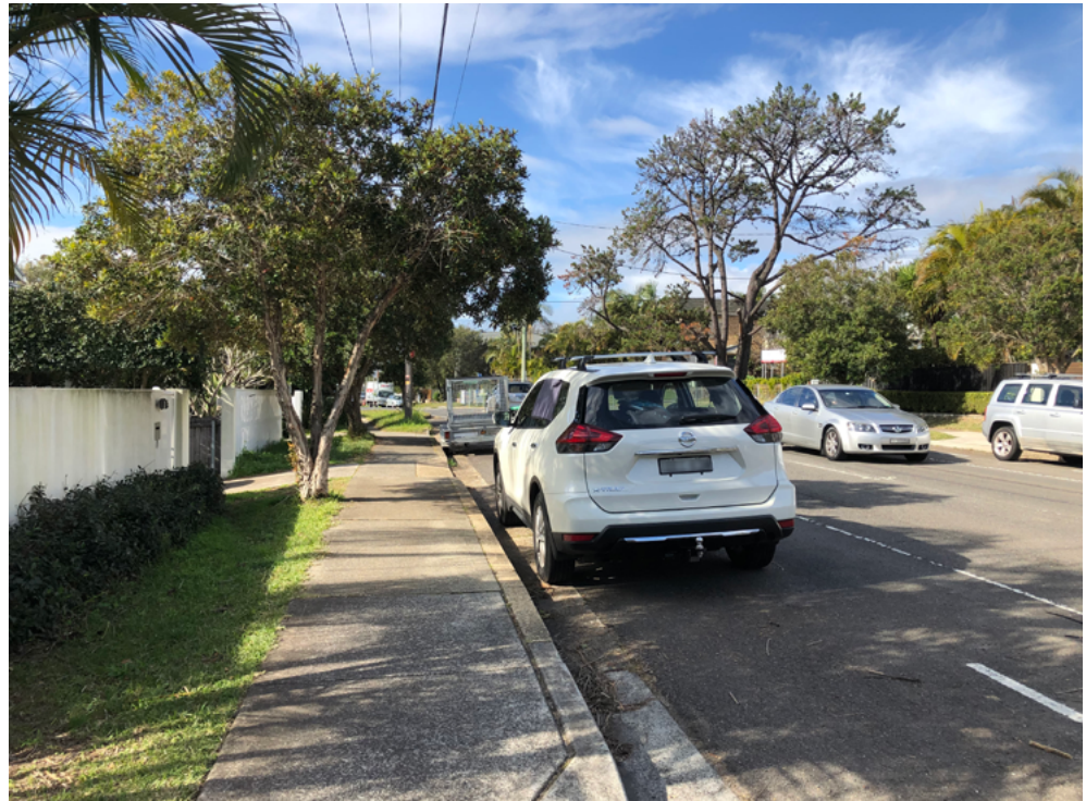
Existing - Bennett Street, Curl Curl