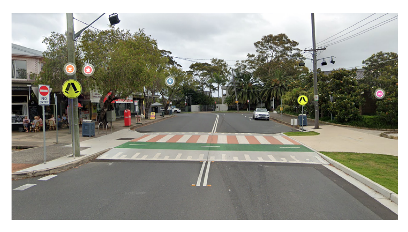
Safer Crossing Treatment Example

Raised Pedestrian and Cycleway Priority Crossing (Kalinya Street, Newport)