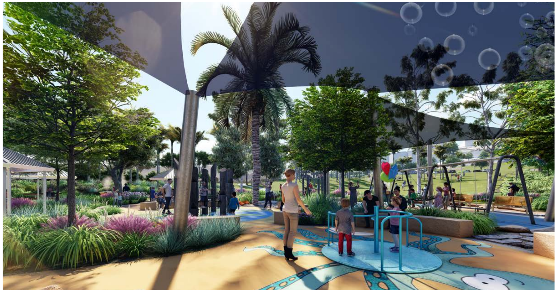
View B: Playground accessible spinner and shade sail view