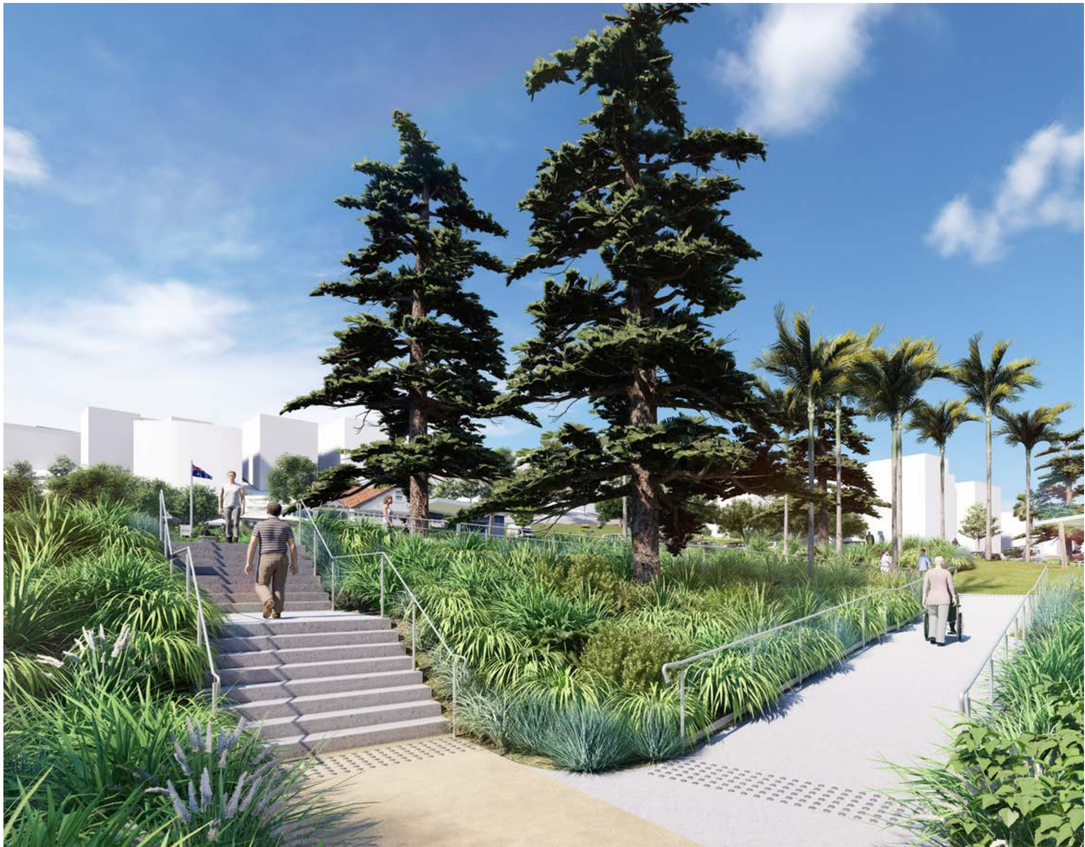
View A: Accessible ramp and stairs