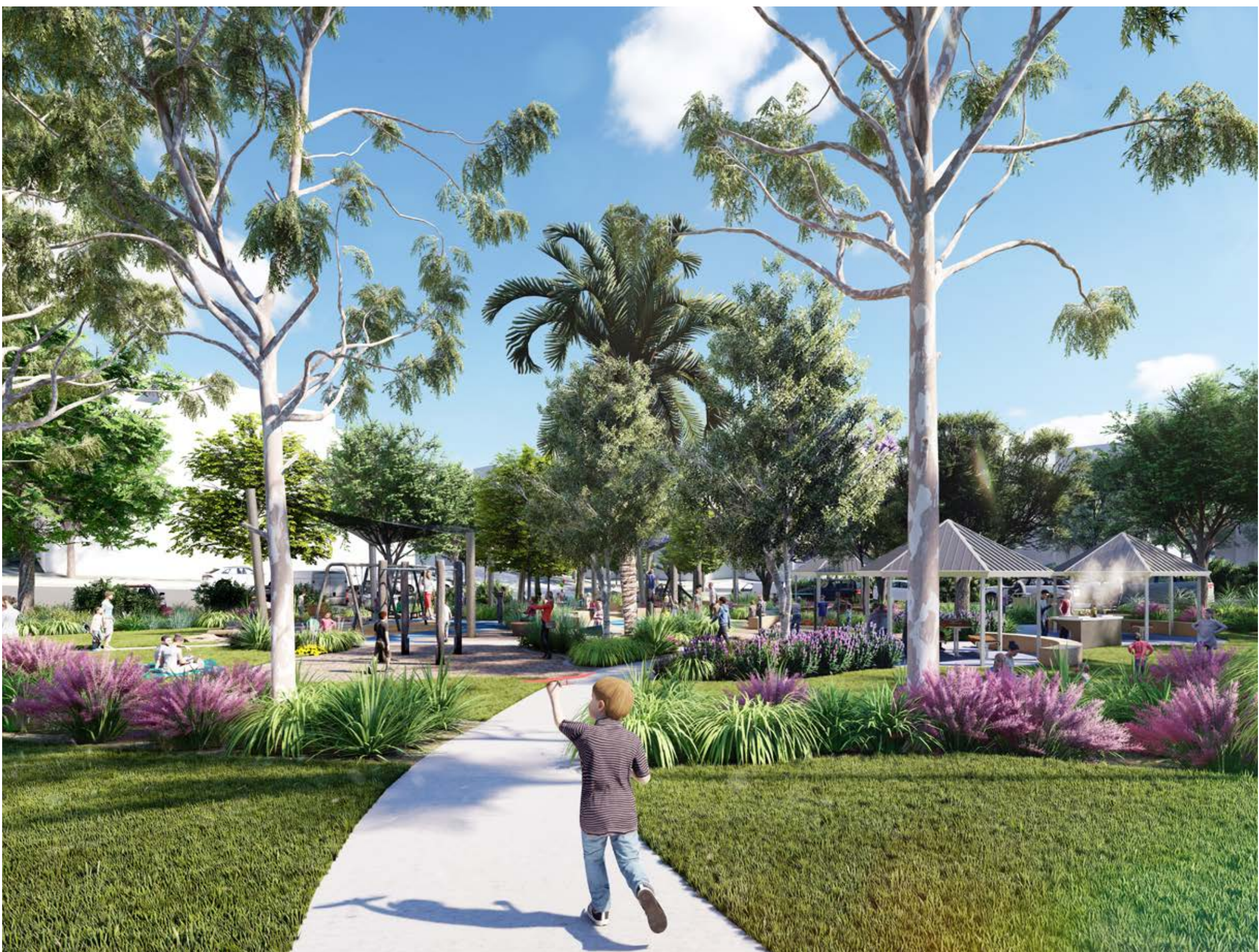
View A: Playground area