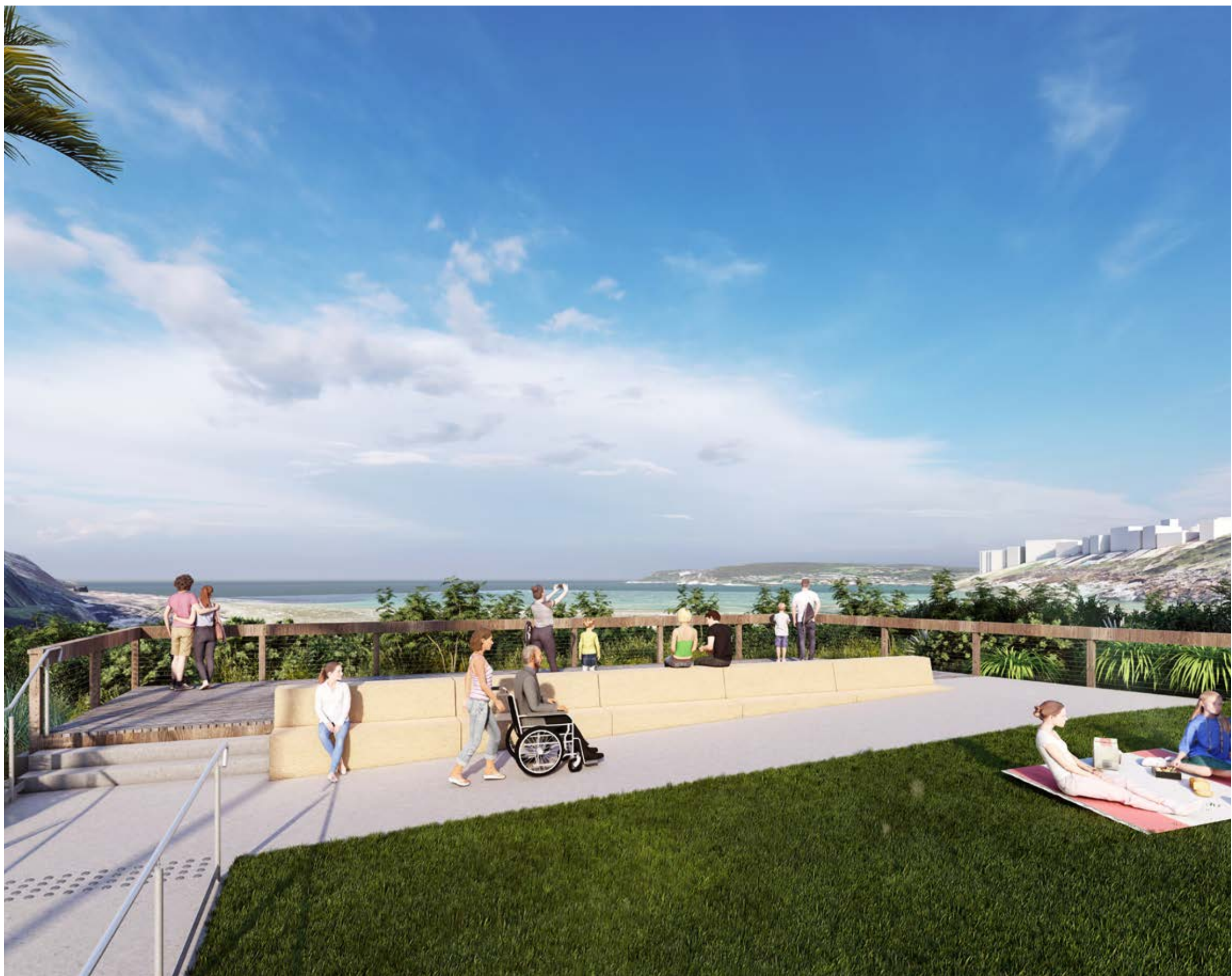
View A: Accessible walkway to lookout and terrace seating