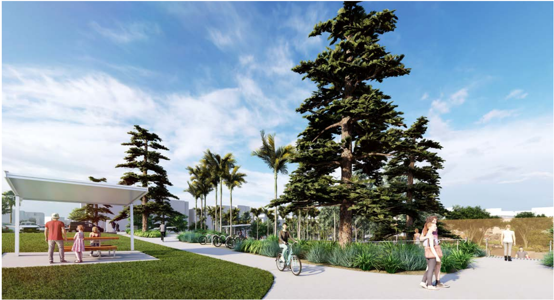
View B: Parkland South with views towards accessible shared way