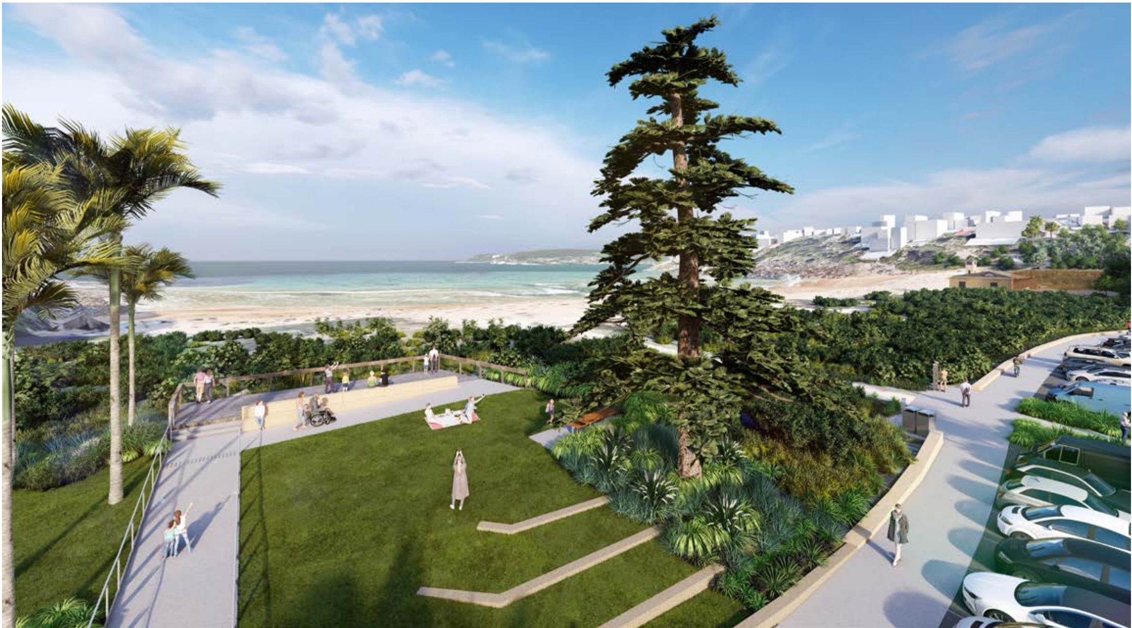
View B: Lookout birdseye view