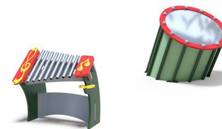
PE4 - SENSORY PLAY