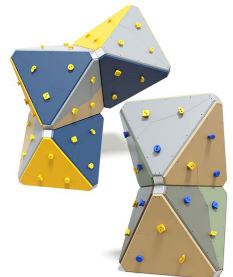
PE6 - SENIOR CLIMBING PLAY