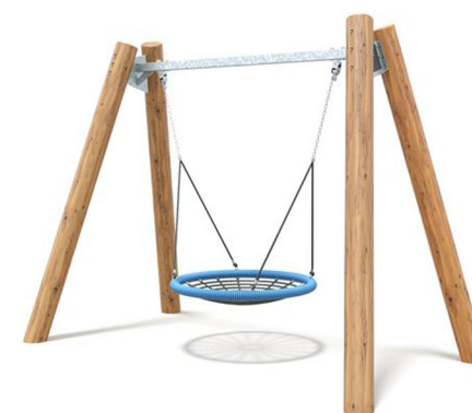
PE5 - INCLUSIVE NET SWING