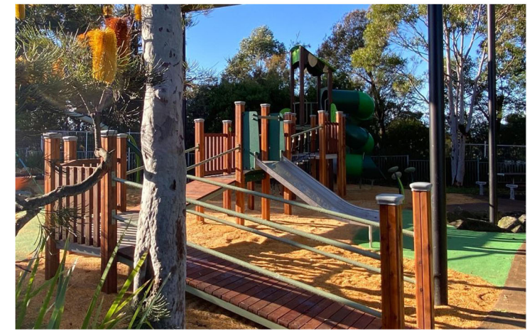
PE1 - CUSTOMISED PLAY ITEM