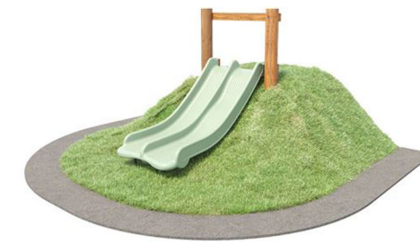
PE2 - EMBANKMENT PLAY WITH SLIDE