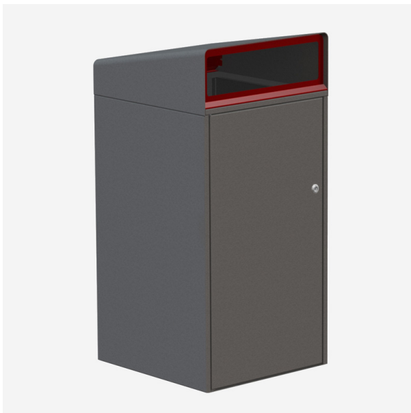
ESCOLA BIN HOUSING