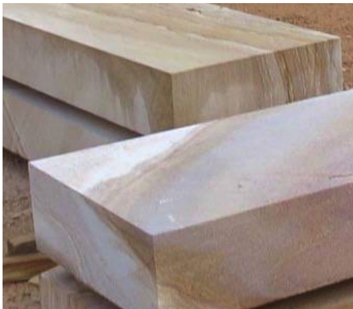
SANDSTONE BENCH SEAT